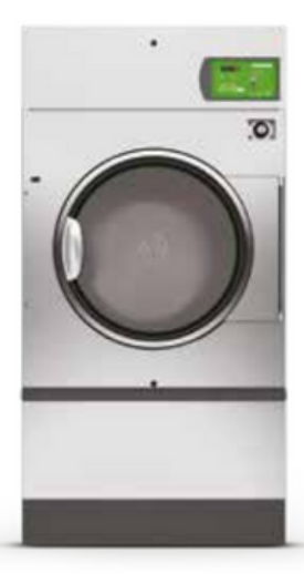
COMMERCIAL SINGLE TUMBLE DRYERS